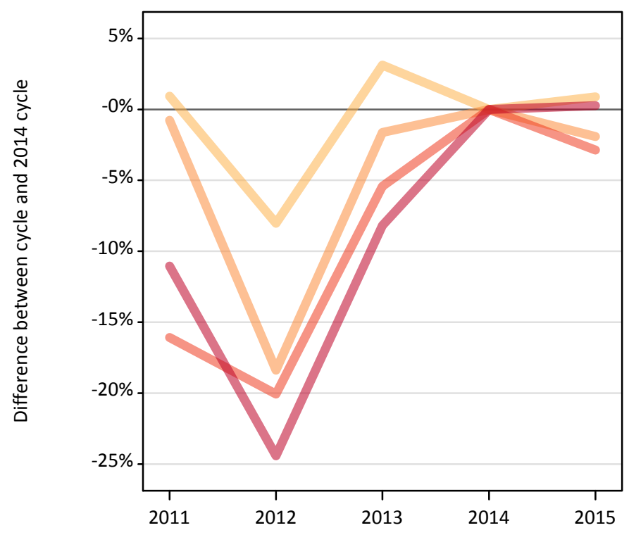
CX.7 Placed applicants from Northern Ireland by age group at 1 day after A level results day All age groups