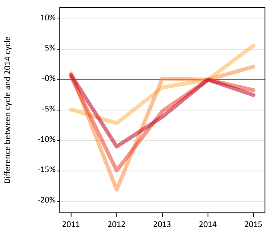
CX.4 Placed applicants from England by age group at 1 day after A level results day All age groups