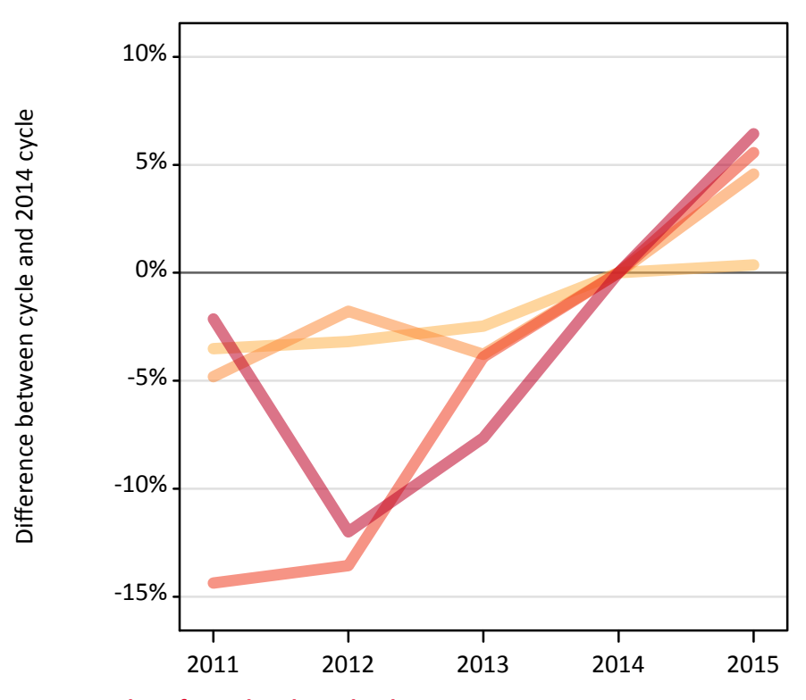
CX.10 Placed applicants from Scotland by age group at 1 day after A level results day All age groups