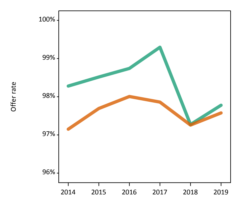
P.6 Percentage point difference between 18 year old offer rate and average offer rate by sex

Note: The line for a group is not plotted when that group made fewer than 50 applications in any of the years from 2014-2019.